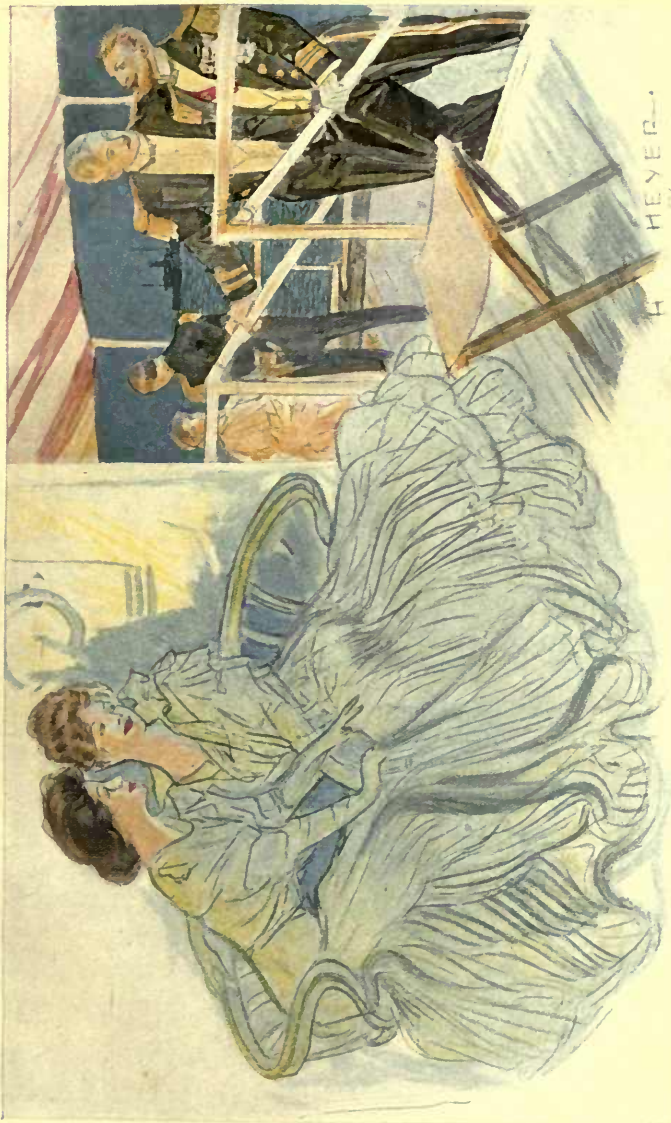
" Ah! here they come! Isn't he perfectly splendid?" (Page 75)